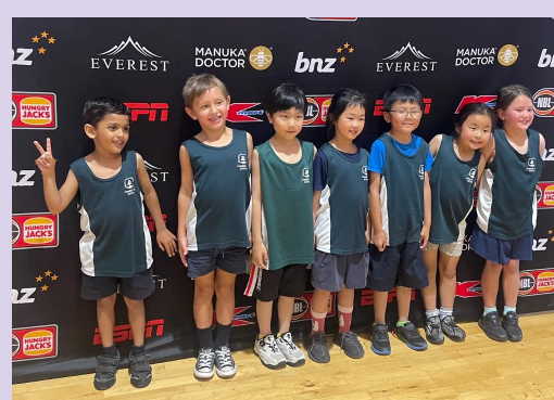
Rockets Year 1/2

Could we please have all singlets WASHED and CLEAN, brought to ROOM 8 by Monday next week.