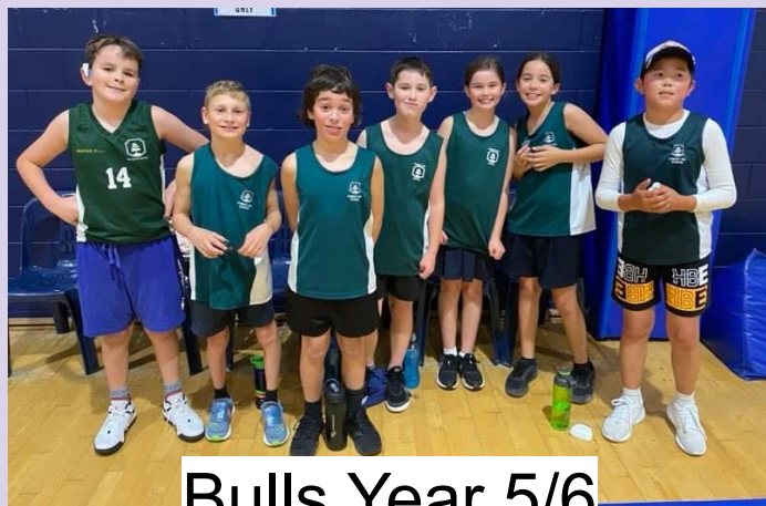
Bulls Year 5/6