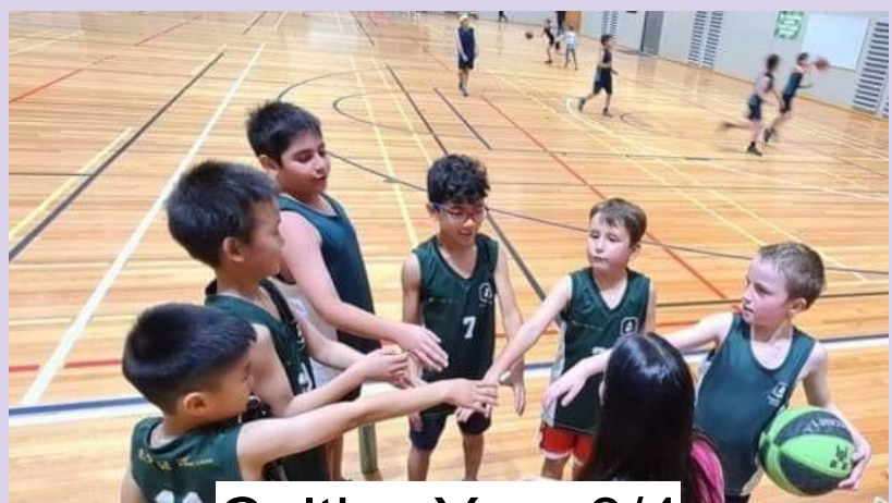
Celtics Year 3/4

If you wish to play Basketball for 2024, please click on the link below and fill out the google form: