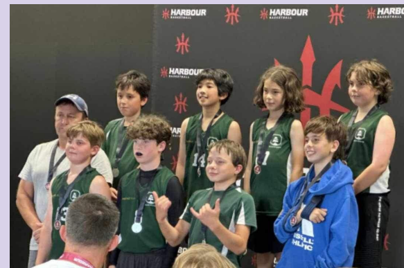
Spurs Year 5/6 2nd Place