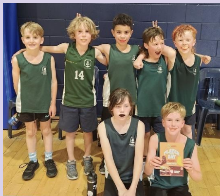
Warriors Year 3/4 2nd Place in Grade B